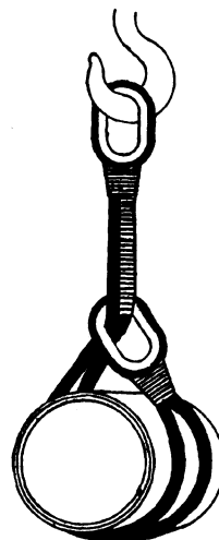
DIAGRAM No. 7.

Safe loads are given in Tables Nos. 7 and 8.