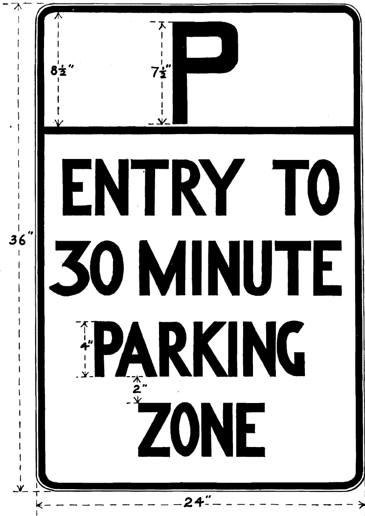
CLASS DA DIAGRAM No. 10

Black letters and lines on a lemon-yellow ground.