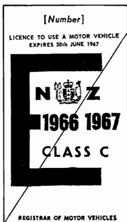
Diagram No. 11A