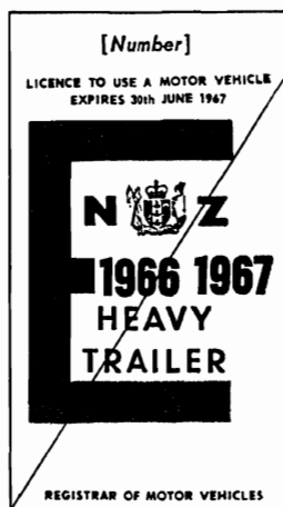
Diagram No. 11B