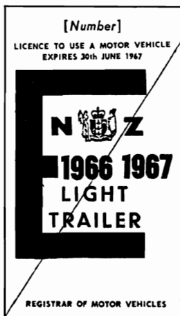
Diagram No. 11C