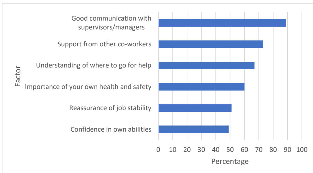
Figure 2: Factors that would encourage you to speak up about health and safety

Participants in the survey were asked how confident they would feel about speaking up about a health and safety issue on a Likert scale ranging from 1-5. The majority of respondents (63 per cent) were classified as confident as they ticked 1 “very confident” and 2. A further 20 per cent were described as neutral and 17 per cent were described as not being confident. When asked who they would feel confident to talk to about health and safety issues, 81 per cent said their boss/manager, 81 per cent their co-workers, 62 per cent friends and family, 59 per cent their supervisor, 35 per cent their head of department and 28 per cent their health and safety advisor; only one participant reported no one. Participants were then asked what factors would encourage them to speak up about workplace health and safety issues, the results are presented in Figure 2.