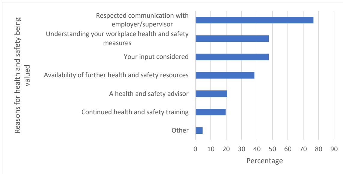
Figure 1: Why participants felt health and safety was valued by their employer