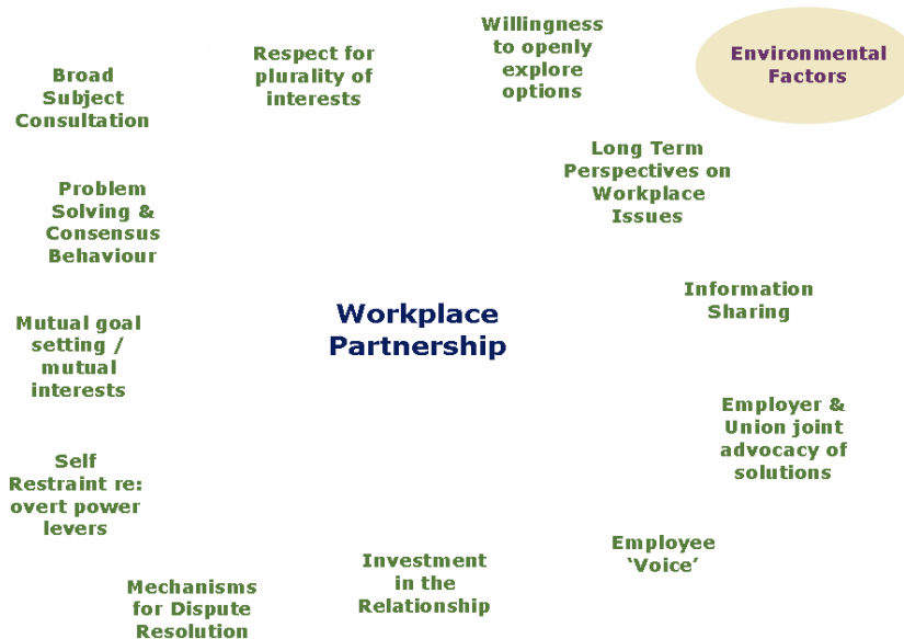
Figure 1: Theoretical Model of Workplace Partnership

A survey was designed based on the theoretical model. The target population was all employers who, at July 2005, had single-employer collective employment agreements registered with the DOL, and representatives of the trade unions who were party to those agreements. The DOL provided the research team with access to the database containing details of registered collective agreements and parties to those agreements, and also to an existing mail-out database. The database was checked and updated to optimize accuracy and likely returns.